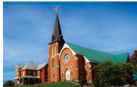
ST. COLUMBKILLE - UPTERGROVE