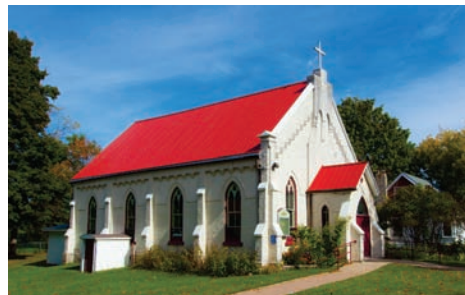
SACRED HEART - WARMINSTER