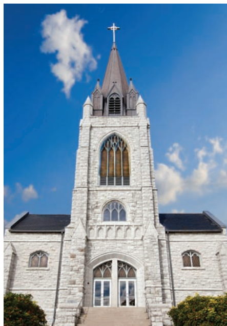
GUARDIAN ANGELS - ORILLIA