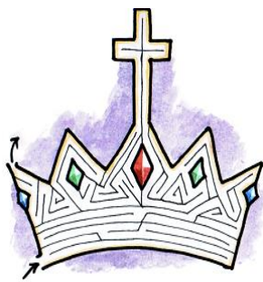
Jesus is Our King!